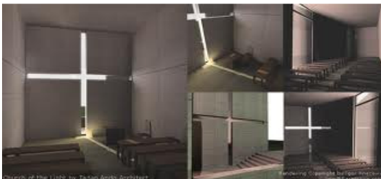
Fig. 3. Tadao Ando – Church of Light.

For reverend karukome, the fact that the altar is set at the lowest point of the church symbolizes “Jesus Christ, who came down to the lowest of us all. “ ANDO says that he would have preferred to leave the glass out of the cross – shaped opening, allowing the wind to enter just as the light does, but climate conditions in winter rendered this solution unacceptable to the church. “Quest for the relation between light and shadow,” and the need for a “shelter of the spirit”.