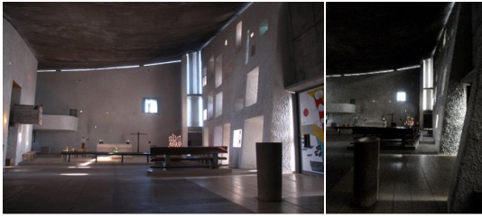
Fig. 12. Le Corbusier-chapel of Notre Dame du haut, Ronchamp.

The protagonist of the interior is, without doubt, the light. By contrast, the church is rather dark, as some Gothic churches are, emphasizing the drama of light and accenting the sacredness of the space.