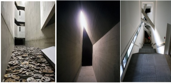
Fig. 10: Daniel Libeskind- Jewish Museum, Berlin.

The building is clad with “zinc” plates and sharp crisscrossing beams and columns will depicts the emotions of Jews. The Jewish race had undergone a lot of suffering prior and during the Second World War. It was also for that the Jewish museum, which will narrate the history of the Jewish race their triumphs, sufferings and pangs for the last two thousand years and it will depict the emotions of the Jews.