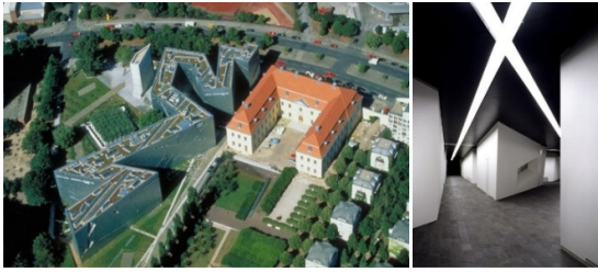
Fig. 9. Daniel Libeskind- Jewish Museum, Berlin.

The building is clad with “zinc” plates and sharp crisscrossing beams and columns will depicts the emotions of Jews. The Jewish race had undergone a lot of suffering prior and during the Second World War. It was also for that the Jewish museum, which will narrate the history of the Jewish race their triumphs, sufferings and pangs for the last two thousand years and it will depict the emotions of the Jews.