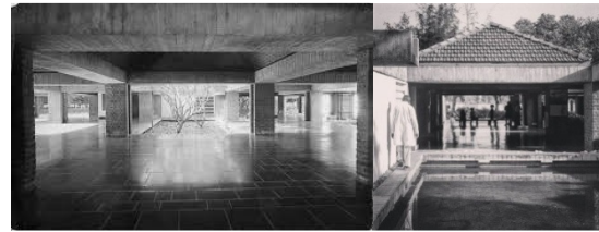
Fig. 8. Charles Correa- Gandhi Smarak Sangrahalaya.

Correa's subtle changes of the enclosure allow for variety in the module's lighting, temperature, and visual permeability. A square, uncovered shallow pool is located between the five rooms. The museum uses a simple but delicately detailed post and beam structure. Load bearing brick columns support concrete channels, which support the wooden roof and direct rainwater. Boards are nailed underneath the joists and tiles are placed atop the joints. The foundation is concrete and is raised about a foot from the ground. The monumental and archetypal structure of the museum recalls the well-known work of Louis Kahn, who began two projects in the region shortly after Correa's museum was built. Wooden doors, stone floors, ceramic tile roofs, and brick columns are the palette of the building.