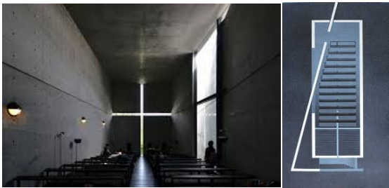
Fig. 2. Tadao Ando – Church of Light.

In this church the light shows a direct relationship to TADAO ANDO’S extremely simplified drawing of the structure. There is a strong contrast between the dark interior of the church and the bright light coming through the cruciform openings. Essentially a rectangular concrete box intersected at a 15 – degree angle by a freestanding wall, the chapel’s most remarkable feature is the cruciform opening behind the altar, which floods the interior with light. With floors and pews made of blackened cedar scaffolding planks, the church of light projects an image of simplicity confirmed by the unusual sloping floor.