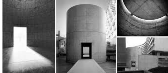
Fig. 4. Tadao Ando–Meditation Space, UNESCO.

In Meditation space (UNESCO), the silence is felt through the texture of cylindrical, reinforced concrete having holes in a rhythm to produce the sense of scale and the light enters through a narrow strip of skylight running around the perimeter and only two openings provided give the space which communicates a sense of solemnity and serenity.