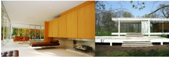
Fig. 19. Ludwig Mies van der Rohe -Farnsworth House.

The plan and elevations of the home are characterized by a lack of symmetry. In the tradition of international modernism, axial symmetry is abandoned in favour of more dynamic architectural forms. This is evidenced in the house by the placement of the core within the home as well as the placement of the lower deck, both of which are centered about neither of axis in plan. Additionally, the home's upper deck assures that the portion of the home enclosed by the glass envelope remains off centre. The interior of the home is characterized by the use of a free plan system. As Mies used it, the free plan featured a single large space, usually broken only by a partial height core. The spaces surrounding the core are demarcated subtly by the wing walls that are utilized in the core design but are not separated formally by full height walls.