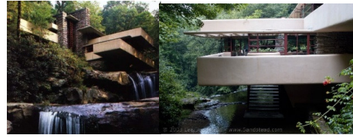
Fig 13. Frank Lloyd Wright- Falling Water, Pennsylvania.

"I'd like to have a free architecture. I'd like to have an architecture that belonged to where you see it standing, and was a grace to the landscape instead of a disgrace, and the letters we receive from our clients tell us how those building we built for them to have changed the character of their whole life, and their whole existence."