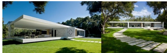
Fig 18: Ludwig Mies van der Rohe -Farnsworth House.

The Farnsworth House is expressed as three horizontal planes, the lower deck, the floor plane/upper deck, and the ceiling/roof plane. These three horizontal planes cantilever beyond vertical members expressing their place at the top of the special hierarchy of the home. The placement of the lowest plane, the lower deck, is asymmetrical in both of the building's major axis. The vertical members who hold these planes in place read strongly in elevation, forming elevations and spaces which express trabeated structural nature.