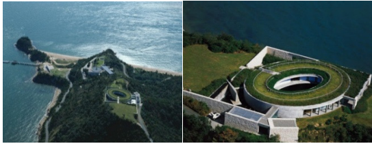
Fig. 5. Tadao Ando-Naoshima Island, Japan.

Architect combined the use of stone rubble walls and exposed concrete which is free – standing linked with nature is remarkable for its lightless and weightlessness, standing as a symbol of architectural transformation. This silence has become an intelligent message: marked by nature and reduced to its essence. Through which new dimension is achieved.