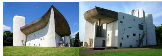
Fig. 11. Le Corbusier-chapel of Notre Dame du haut, Ronchamp.

Chapel of Notre-Dame play between light and mass becomes central to Le Corbusier design in a new and meaningful way. Light dematerializes mass, cutting through shadow and making it appear darker—deeper. Shadows trail across granite walls, textured like sandpaper and, when followed, lead to hidden pockets of densely channeled light full of color carving out and illuminating smaller chapels. Light and shadow provide the media through which Le Corbusier communicates with visitors, immersing them in a fully synaesthetic visual tactility. While maintaining harmony, dynamism and coherence. This feature forces the visitor to walk around chapel in order to fully understand it, adding a fourth dimension to the architectural composition: movement. Having concave and convex shape walls , random pattern of rectangular windows of different size and its orientation, semi cylindrical towers , hidden concrete columns through which the drama of light is created in the form of direct, reflected (striking effect) with various intensity to have the feel of silence in the slightly inclined floor towards the altar. Reflection of light creates first the shocking (in between the positive and negative silence) feeling like wow. Then peace and feel of amazing and surprised silence of space.