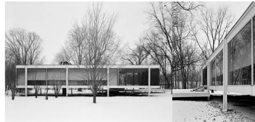
Fig. 17. Ludwig Mies van der Rohe -Farnsworth House.

The Farnsworth House is an exemplary representation of both the International Style of architecture as well as the modern movement's desire to juxtapose the sleek, streamline design of Modern structure with the organic environment of the surrounding nature. Mies constructed this glass box residence of "almost nothing"[9]