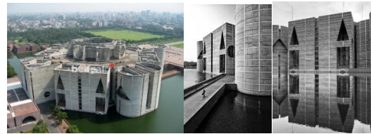
Fig. 14. Louis I Kahn -National Assembly, Bangladesh.

This silence is achieved through the calmness of Still Water Lake. The baffled light and its reflection through still water and the openings in square, elliptical, semi-circular ,triangular and hollow columns to make that space calm and quiet by defining the proportions and forming the deep shadows. The architectural image of the assembly building grows out of the conception to hold a strong essential form to give particular shape to the varying interior needs, expressing them on the exterior.