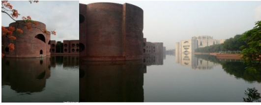
Fig 15: Louis I Kahn -National Assembly, Bangladesh

In this part the silence is achieved through the deep forming shadows with the marble bands are flush with the concrete, so that the floor lines are not legible.