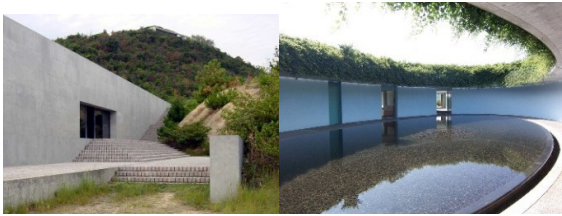
Fig. 6. Tadao Ando-Naoshima Island ,Japan.

Architect combined the use of stone rubble walls and exposed concrete which is free – standing linked with nature is remarkable for its lightless and weightlessness, standing as a symbol of architectural transformation. This silence has become an intelligent message: marked by nature and reduced to its essence. Through which new dimension is achieved.