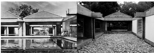
Fig. 7. Charles Correa- Gandhi Smarak Sangrahalaya.

“Certainly architecture is concerned with much more than just its physical attributes [5]. It is a many-layered thing. Beneath and beyond the strata of function and structure, materials and texture, lie the deepest and most compulsive layers of all. And these can manifest themselves not only in epic monumental architecture, but in projects of a much smaller, more humble scale as well”. (Colin et.al. 2011).